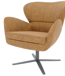
Metal leg-cross D13