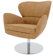
Metal leg-plate D09