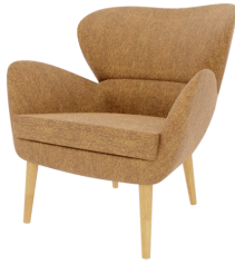
Wooden leg GL