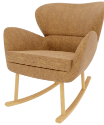
Wooden leg H16