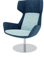
Metal leg plate - D09