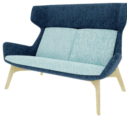
Wooden leg L41