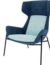
Metal leg P19