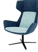
Metal leg cross - R13