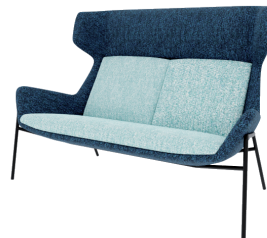
Metal leg P22