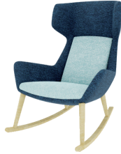
Wooden leg H20