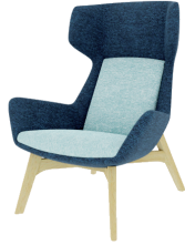
Wooden leg L10