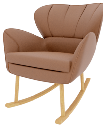
Wooden leg H16