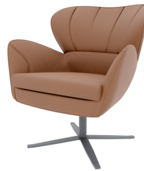
Metal leg-cross D13