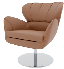
Metal leg-plate D09