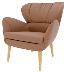
Wooden leg GL