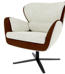
Metal leg-cross D13