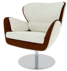
Metal leg-plate D09