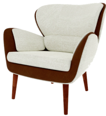
Wooden leg GL