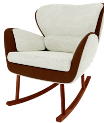
Wooden leg H16