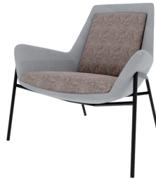
Metal leg P19