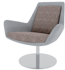
Metal leg-plate D09