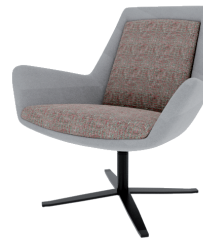
Metal leg-cross D13