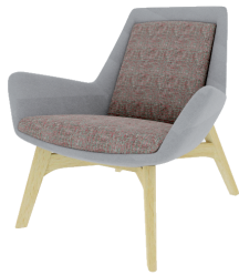
Wooden leg L10